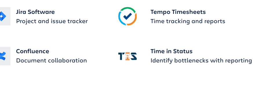
ScriptRunner The leading automation and